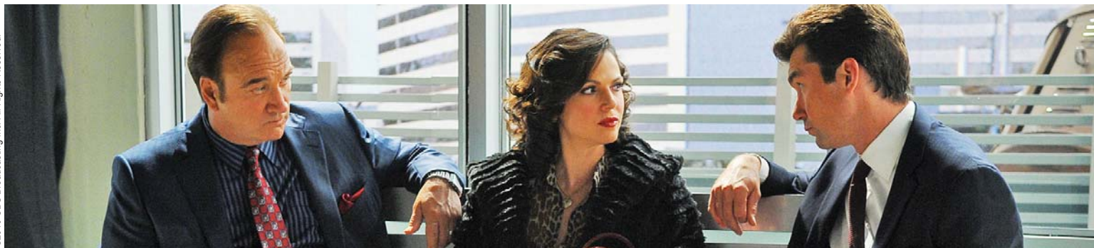
"LAS VEGAS V. JOHNSON" — Nick Morelli (Jim Belushi, left) begrudgingly accepts Pete Kaczmarek (Jerry O'Connell, right) request to represent the finicky mistress, Black Betty (Lana Parrilla, center) on THE DEFENDERS , which airs Wednesdays (10:00-11:00 PM, ET/PT) on the CBS Television Network.